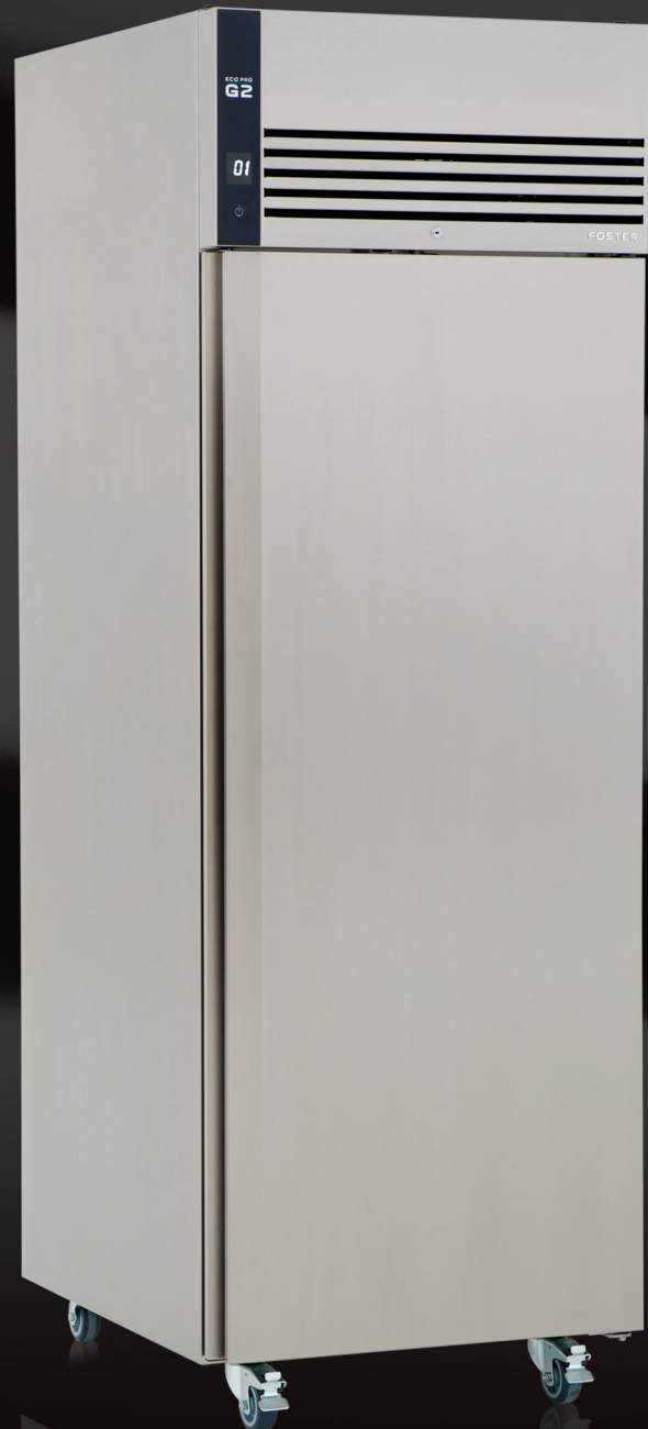
EP700H Refrigerated Cabinet