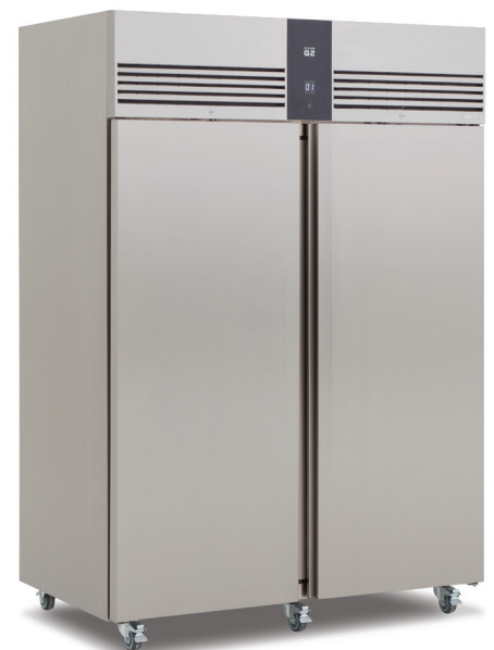
EP1440H Refrigerated Cabinet